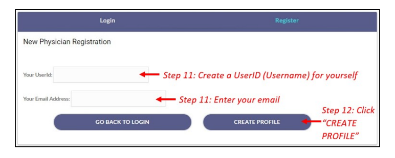
Step 12: Click "Create Profile."

Your login credentials, including a temporary password, will be emailed to you immediately after completing this step and you can begin to use the Registry.